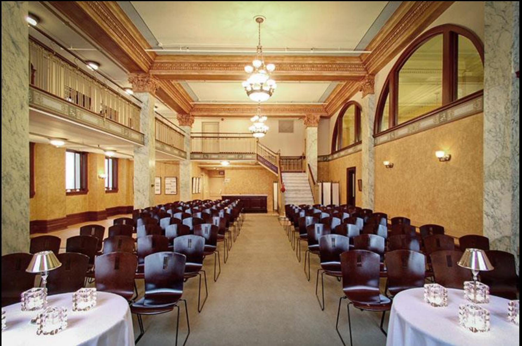
The first floor hall known as The Gallery. Credit: Bofei Cao. Source: Trust, O. H. (n.d.). Meetings and Corporate Events. The Ontario Heritage Trust . Retrieved October 30, 2017, from http://www.heritagetrust.on.ca/en/index.php/pages/about-us/heritage-venues/meetings-and-corporate-events