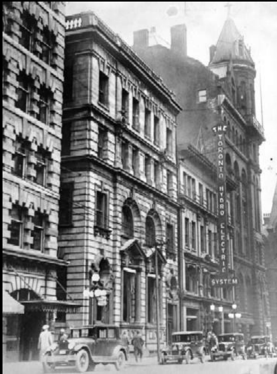
Photo taken in 1927 shows the Birkbeck Building and the surrounding structures.