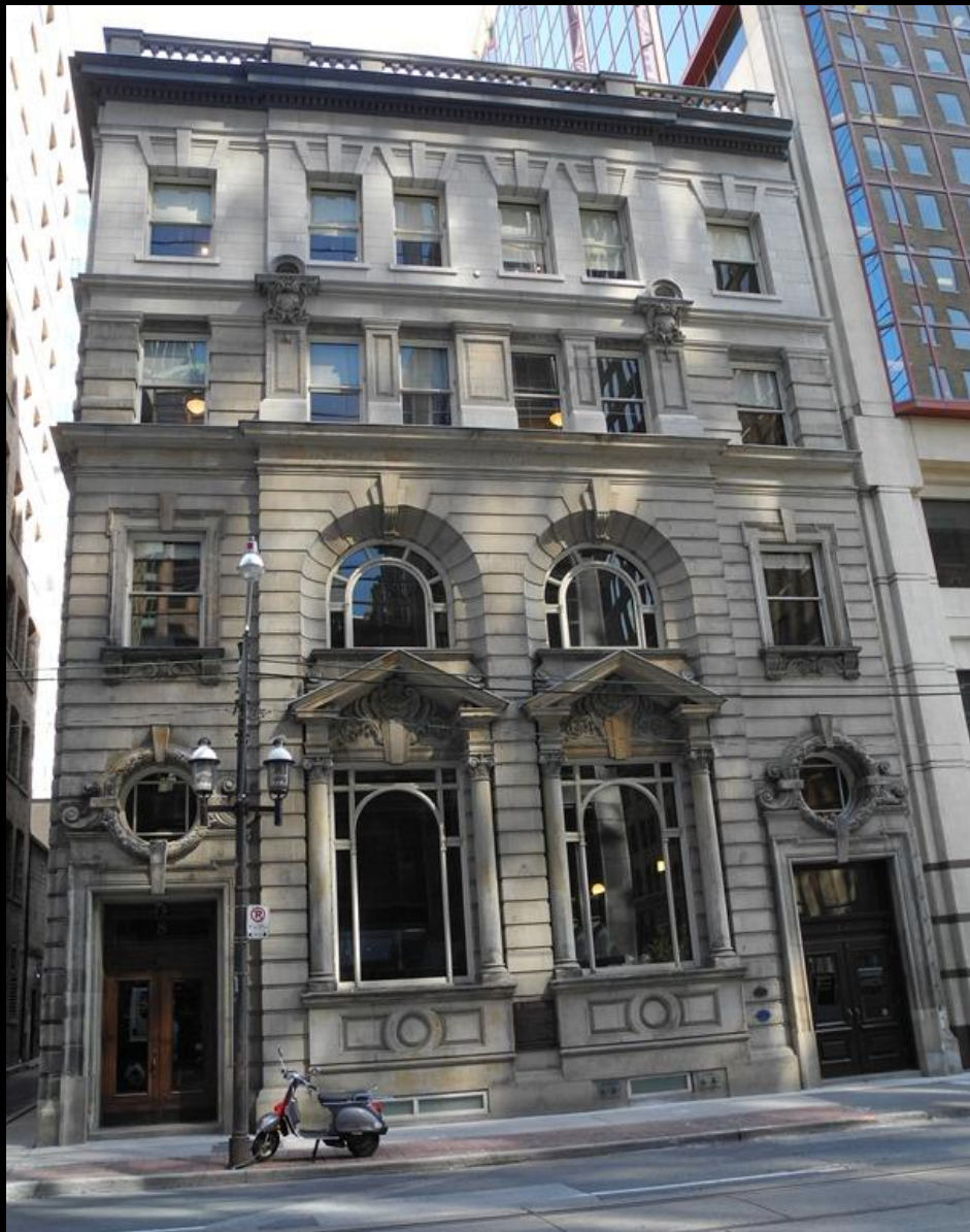
Birkbeck Building Façade.