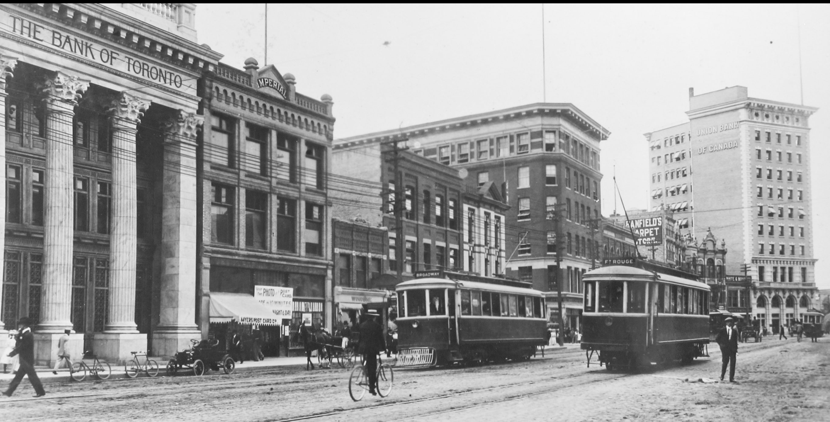
Newly constructed Union Bank Tower seen far right , situated along Main Street, 1907.