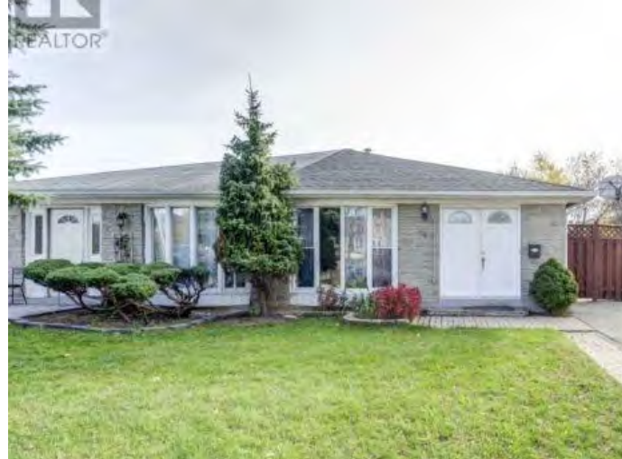
Semi-detached house, Bramalea

https://www.brampton.ca/EN/Arts-Culture-Tourism/Cultural-Heritage/Documents1/Main-Street-South-HCD-Property-Information-Sheets.pdf