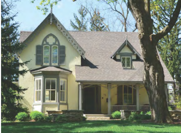
House in Main St S. HCD

https://www.brampton.ca/EN/Arts-Culture-Tourism/Cultural-Heritage/Documents1/Main-Street-South-HCD-Property-Information-Sheets.pdf