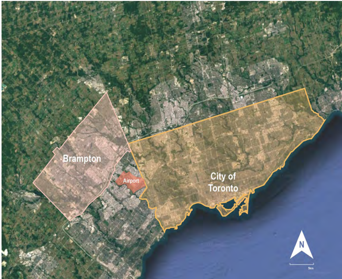
Brampton in context (base image Google Maps, illustrated by author)