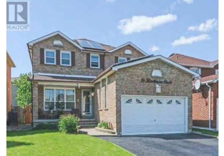
Detached house, County Court

https://www.realtor.ca/real-estate/21324990/3-1-bedroom-single-family-house-74-davenport-cres-brampton-southgate