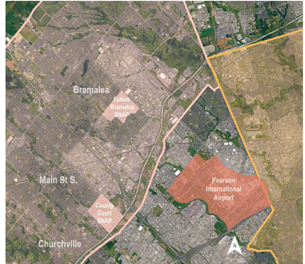
Bramalea and County Court in context (base image Google Maps, illustrated by author)