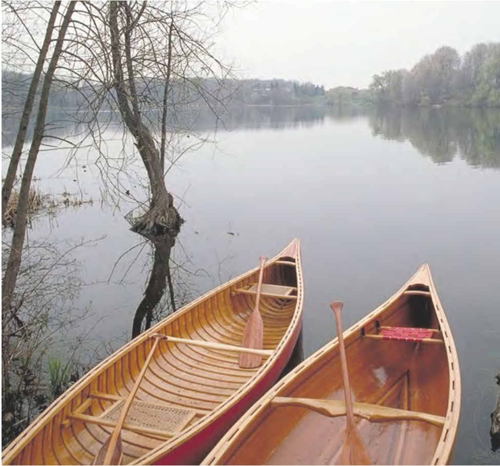
Heart Lake Conservation Park, Brampton

http://www.brampton.ca/EN/Arts-Culture-Tourism/Tourism-Brampton/Visitors/Pages/ParksandConservationAreas.aspx