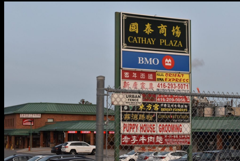
Top left: Parkdale, top right: Regent Park, bottom left: Victoria Park, bottom right: Agincourt (Block by Block)