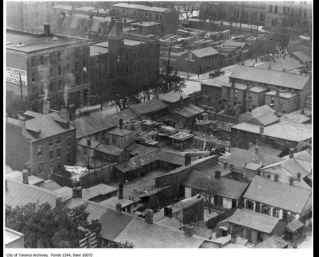
Photograph of The Ward (Toronto Ward Museum)