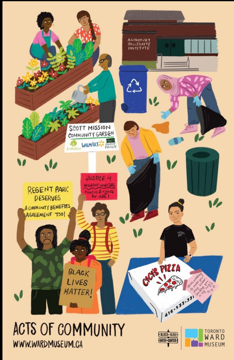
Acts of Community Poster (Block by Block)