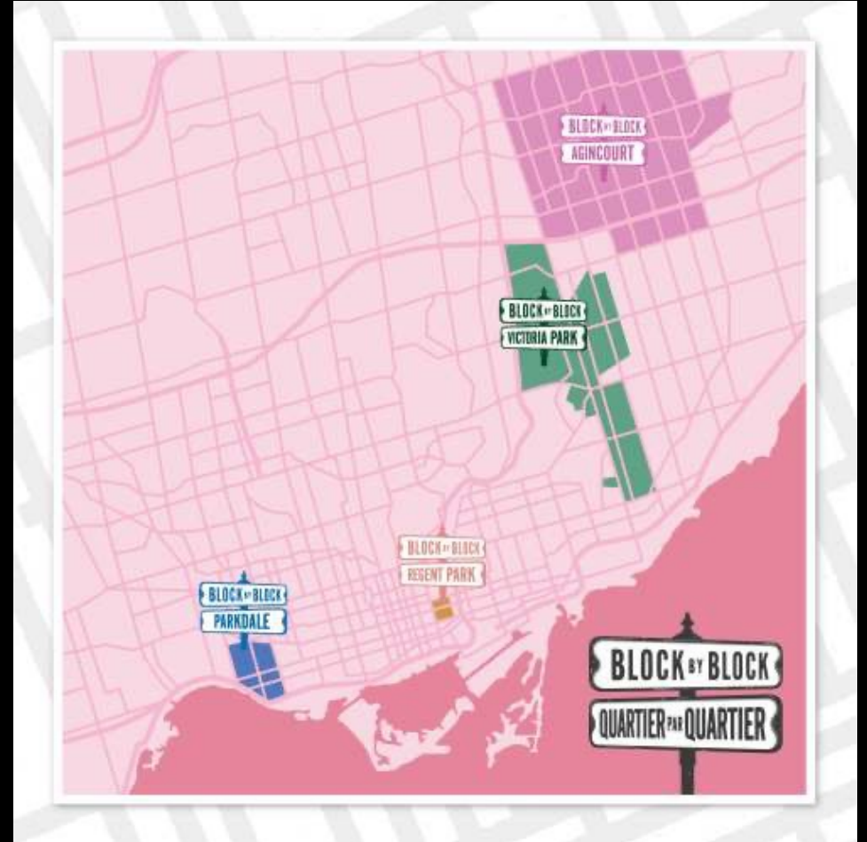
Map highlighting the 4 neighbourhoods which are part of the project. (Block by Block).