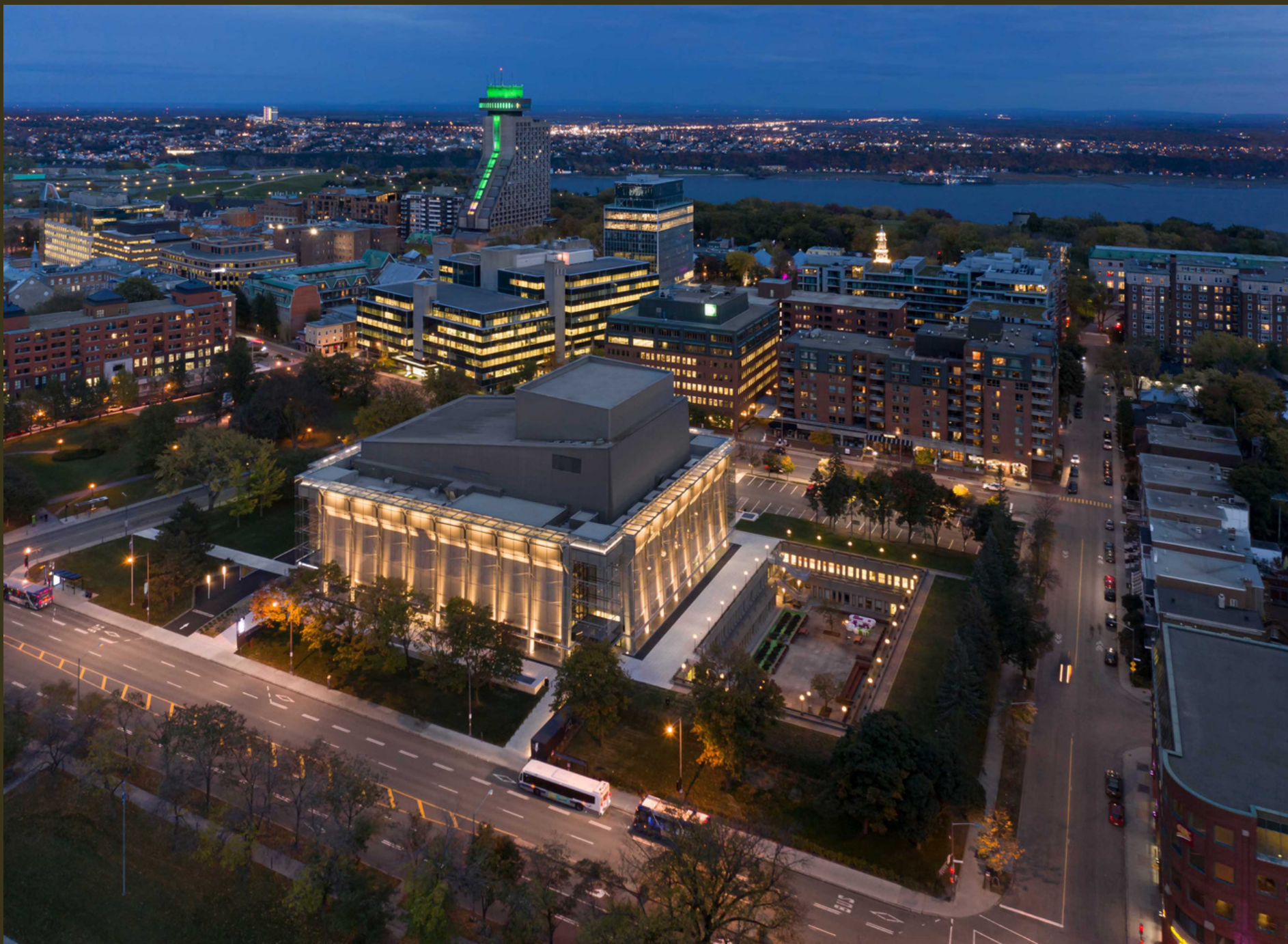
Grand Theatre and surrounding area