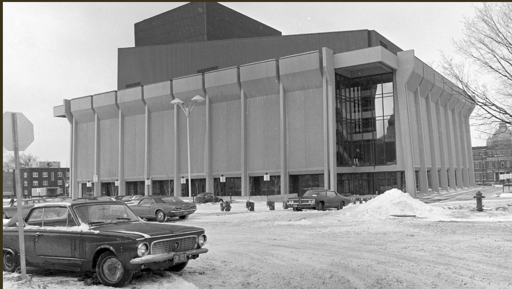
End of construction of the Grand Theatre in 1971