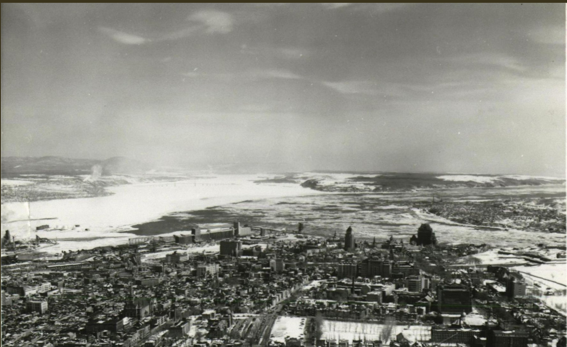
Location of site before construction