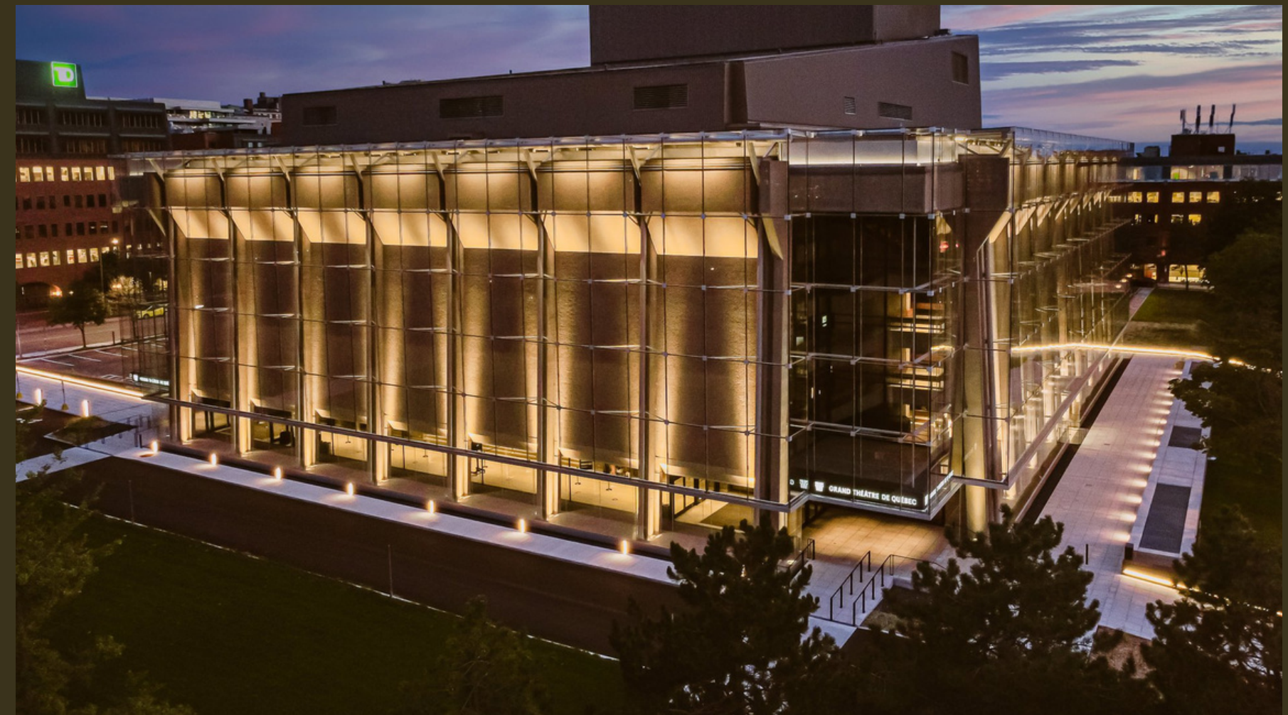
After rehabilitation work in 2017